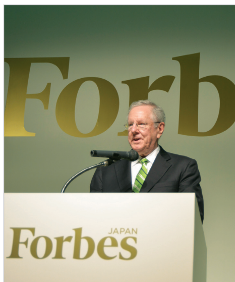
An opening address by Steve Forbes, Chairman and Editor-in-Chief, Forbes Media

Japanese Prime Minister Shinzo Abe congratulated the launch of Forbes Japan with a special video message delivered at the event. In the message Abe said: "The launch of Forbes Japan at this critical time is very significant. It creates a vital bridge of information between Japan and the world. The launch of Forbes Japan will make a powerful contribution to changing the inward-looking mindset that has restrained Japan for too long". The complete video message can be viewed on Forbes.com: www.forbes.com/video/3664443515001