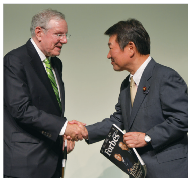
(Left to right) Steve Forbes, Chairman & Editor-in-Chief, Forbes Media; Toshimitsu Motegi, Minister of Economy, Trade and Industry, Japan